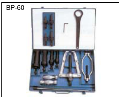
BP-60 For removing internal and external bearings