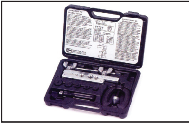
Made of heat-treated alloy steel.

Flares tubing up to SAE 45° for copper & aluminium.