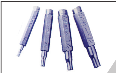
Made of alloy steel, zinc plated.