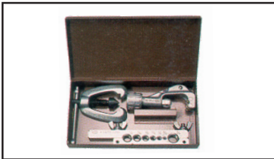
Made of heat-treated alloy steel.

Precisely flares tubing up to 0.040 wall thickness, up to 45° for copper, aluminium & mild steel but not stainless steel.