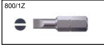
800/1Z DIN 5264-C ISO 2380