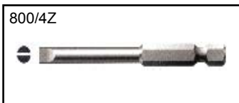
800/4Z DIN 5264-C ISO 2380

Made of heat-treated alloy steel. For manual or power drive