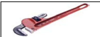
Ridged pattern, spheroidized ductile handle, incorporate extra-hardened milled teeth jaws that guarantee efficient gripping.