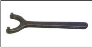
Made from carbon steel, black finish.