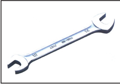
Chrome vanadium steel, JIS standard.