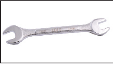
Chrome-vanadium steel, raised panel handle, matt finish. ANSI standard. (American National Standards Institute)