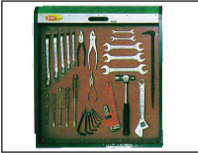
MK31T (Tools Only)